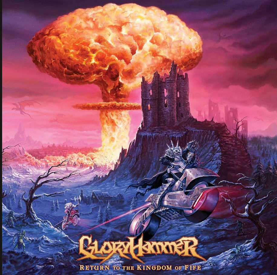
GLORYHAMMER RETURN TO THE KINGDOM OF FIFE

He is the keeper of the celestial flame Yeah, yeah